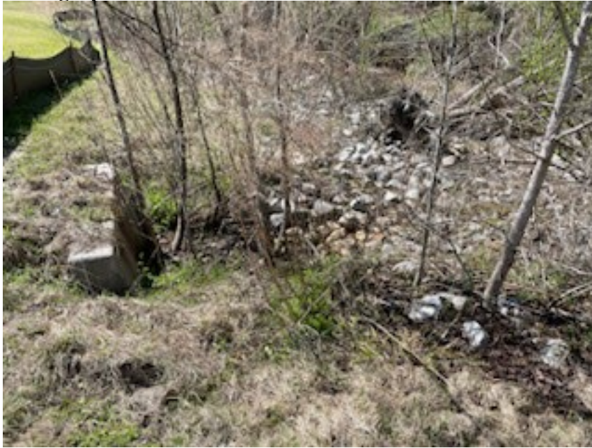
Outfall on NE of facility