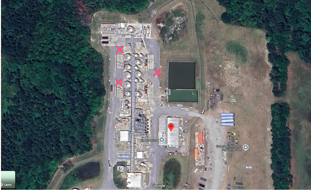
Marked with an X: Areas where odor was detected during site visit walk