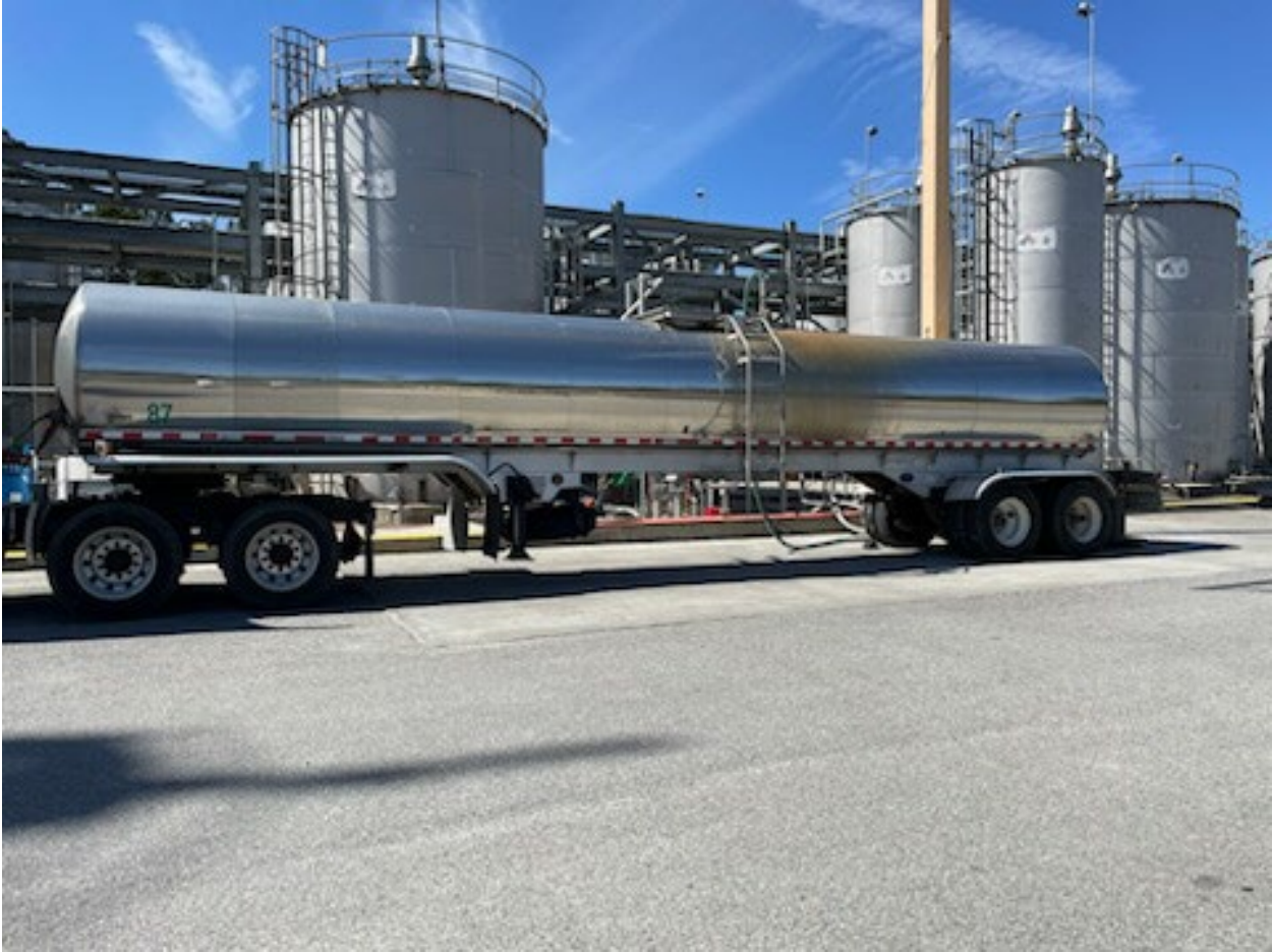
Loading of waste into truck