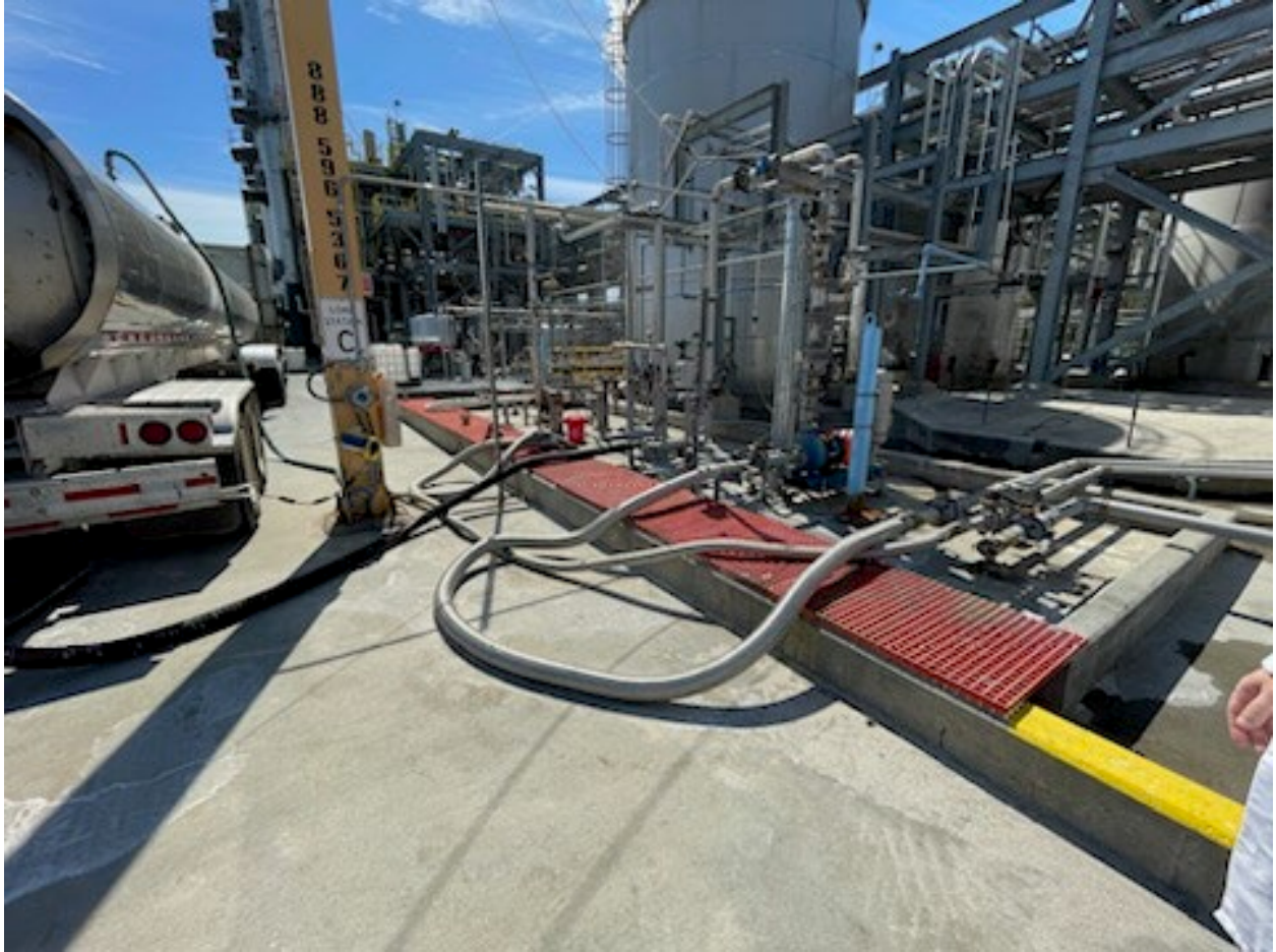
Loading area piping