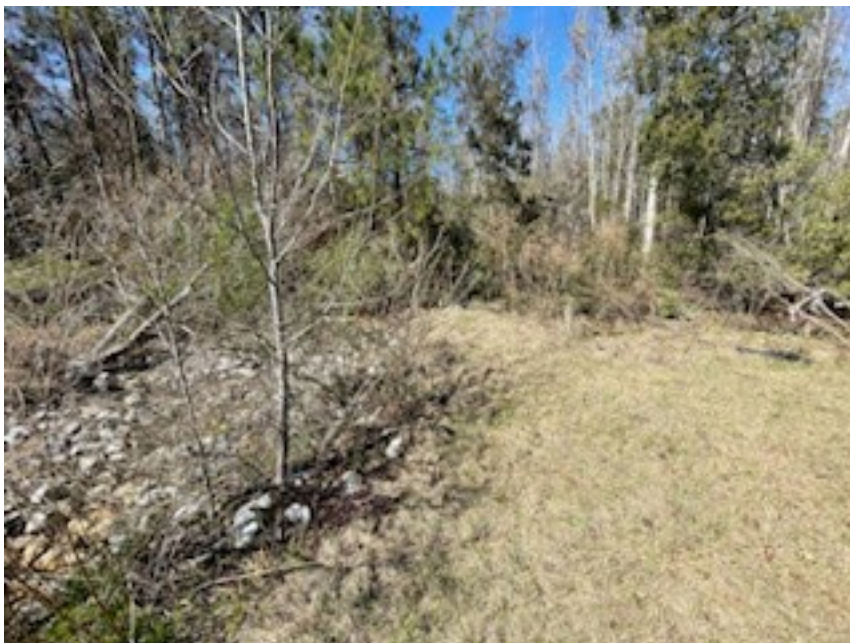
Outfall extending into treeline