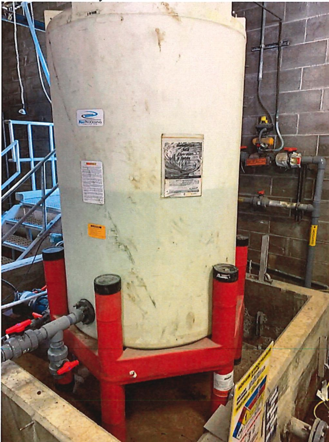
New Permanent System