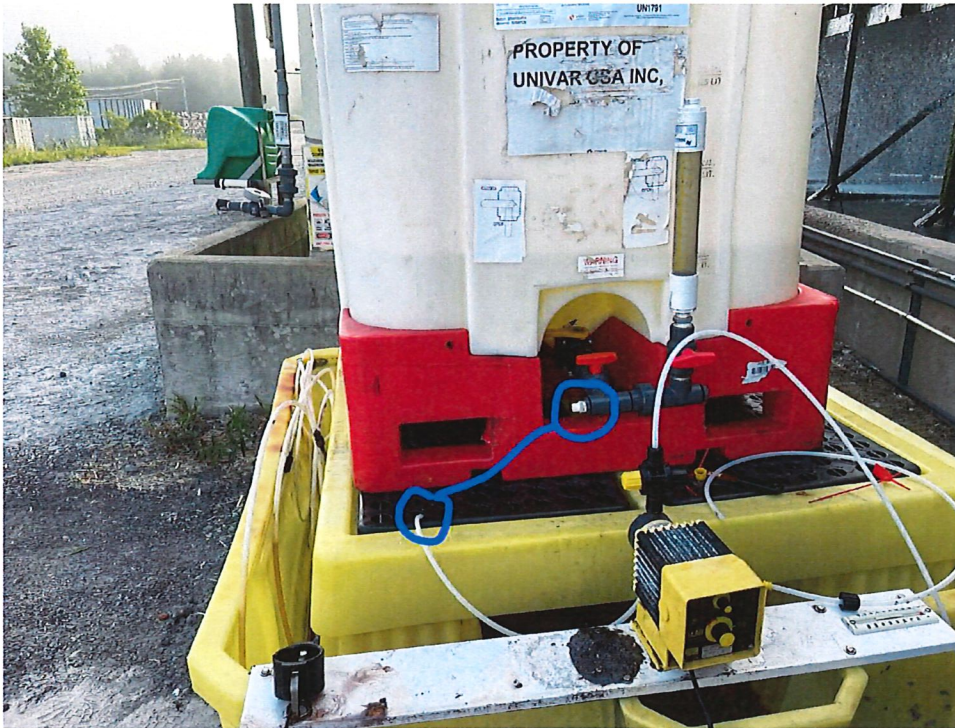
Temporary System Showing Failure Point